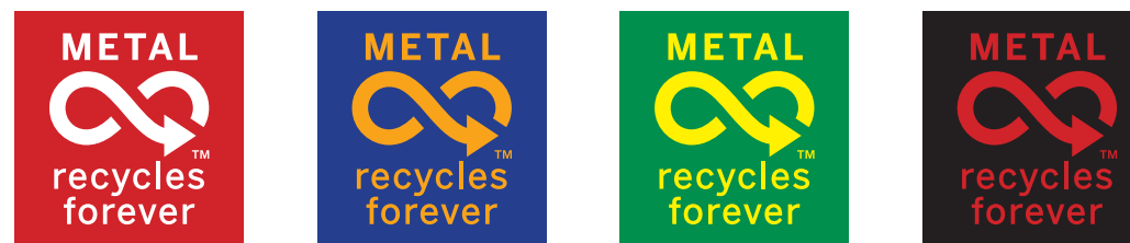
Examples showing the use of the Recycles Forever Mark in two primary brand colours.