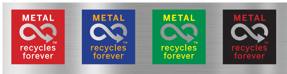
Examples showing the use of the Recycles Forever Mark in two primary brand colours when applied directly to metal substrate.